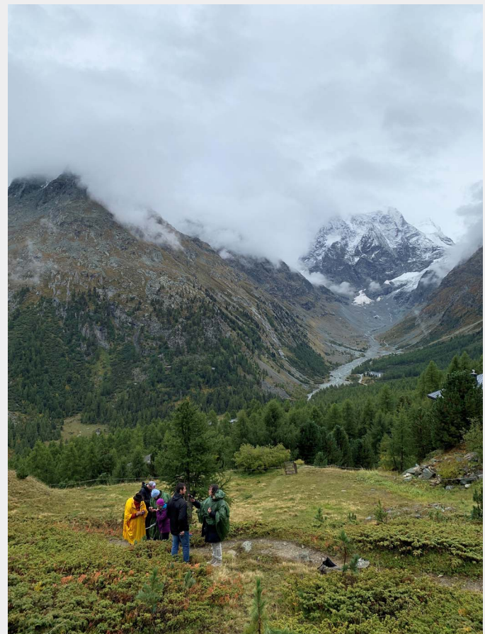
FIGURE 2 Inhabitants and researchers on a joint field campaign to measure tree growth at the upper forest limit.

context of the coronavirus disease 2019 pandemic, it was difficult to involve people in social activities. However, it was a kind of fear of doing research, collaborating with researchers,