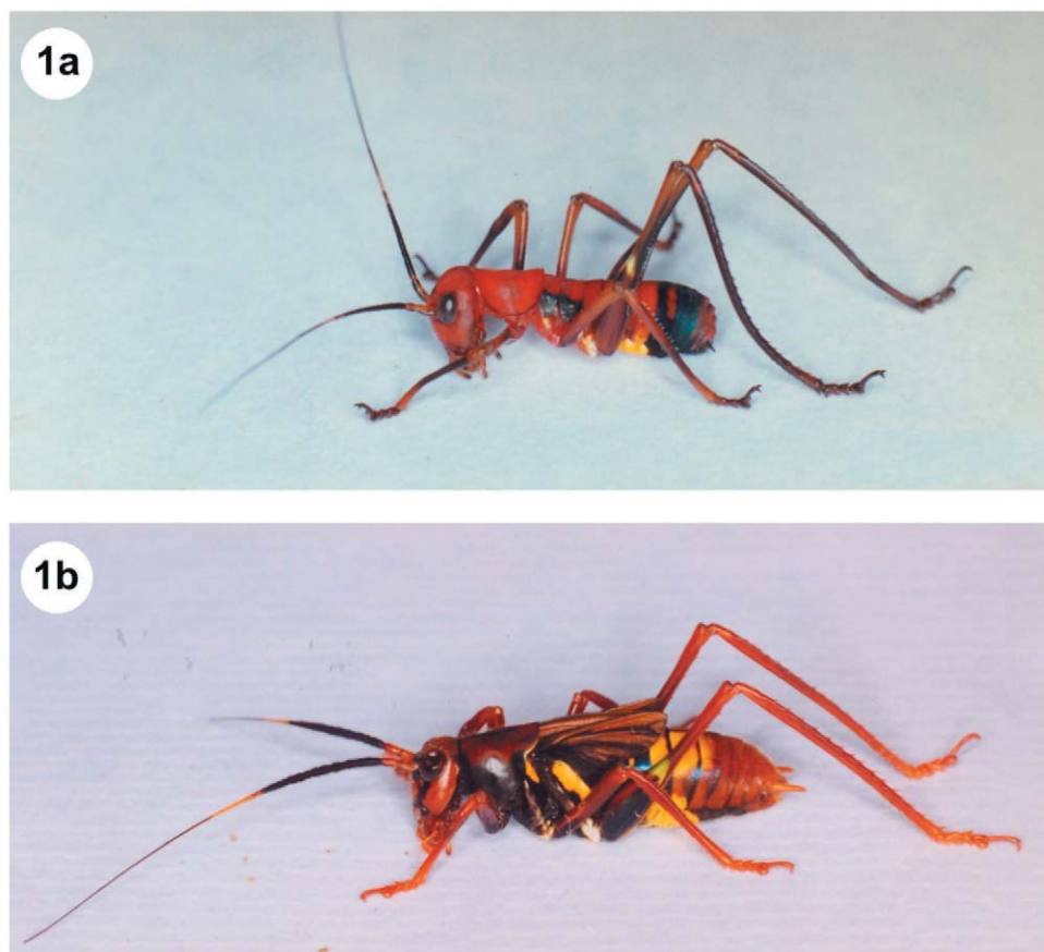
Fig. 1. Nymphs of S. nigra . a) third-stage nymph. b) fifth-stage nymph. For color version, see Plate II.

neo-XY sex chromosome mechanism does not differ in principle from that already described by McClung (1902, 1905, 1917), White (1951, 1953), Dave (1965), White et al. (1967), Fernández-Piqueras et al. (1982), Ferreira (1969, 1976), Messina et al. (1975), Alicata et al. (1974), and Hewitt (1979). There was a centric fusion involving a long acrocentric X chromosome, the biggest one of the set, which is totally heteropicnotic during the first prophase; the biggest of the second group was formed by acrocentric autosomes, giving rise to the biggest element of the set that becomes submetacentric and is now recognized as neo-X. Its bigger arm, the former X, is now called XL and the shorter, the ex-autosome of XR. The unfused autosome has become the neo-Y chromosome.