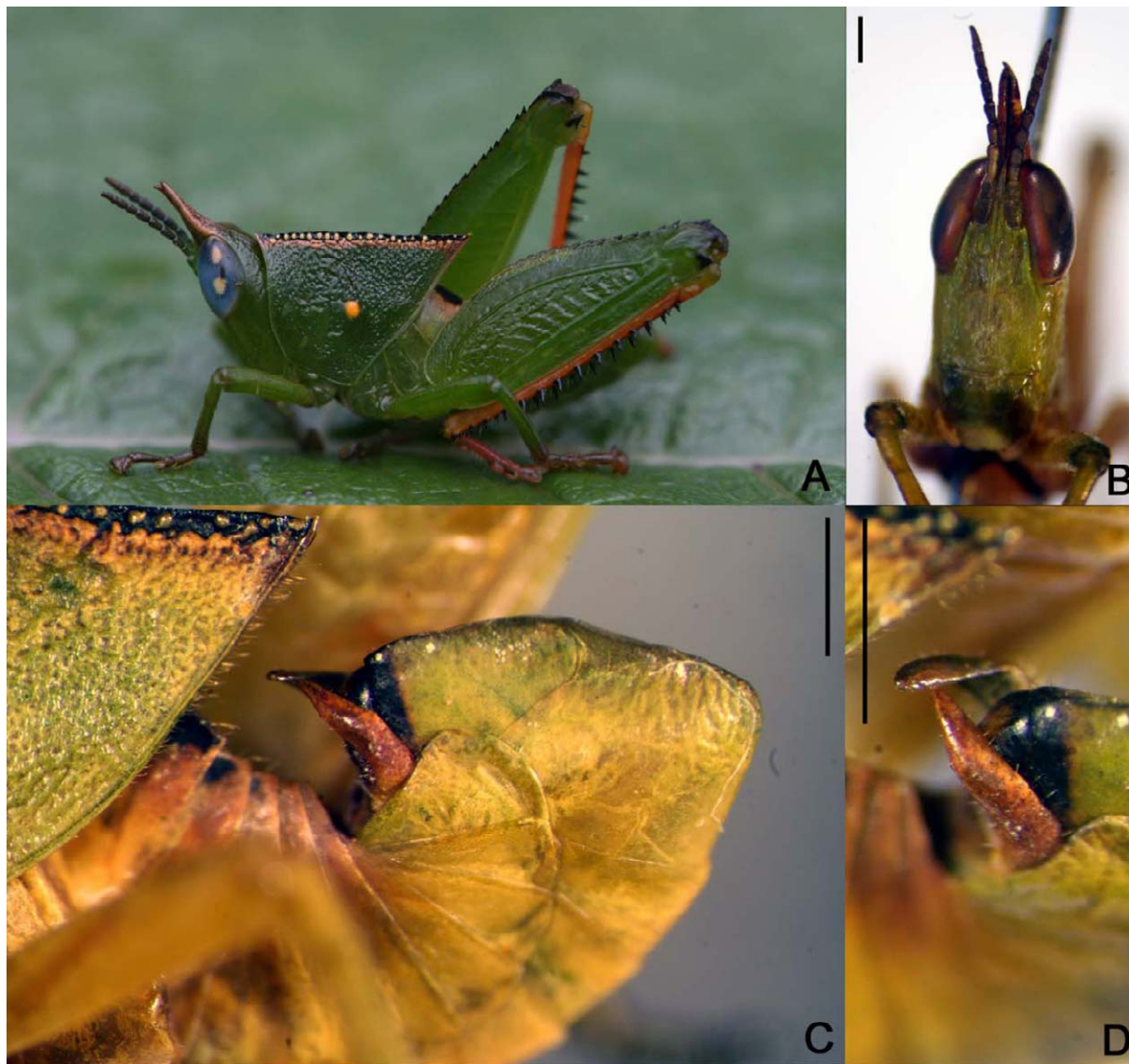
Fig. 1. Plagiotriptus discolor n.sp. A. Male holotype, forest edge of lower border of montane forest on Mt. Vuria, 1950 m in the Taita Hills of Kenya. B. Face and elongated fastigium verticis, holotype male; C. Detail of apex with upturned subgenital plate and cerci, paratype. D. Male cerci, dorsal-lateral view. Scale bar: 1 mm. For color version, see Plate VI.

ate; alae red; Tanzania, East Usambara, Uluguru . . . . . . . . . . P. carli (C. Bolivar, 1914) 9 ♂ Tegmina reduced but wing-like and reaching past posterior edge of 2nd abdominal tergite; tegmina and alae bluish white of mat mildew appearance; Tanzania, Udzungwa Mts . . . . . P. peterseni Johnsen, 1986