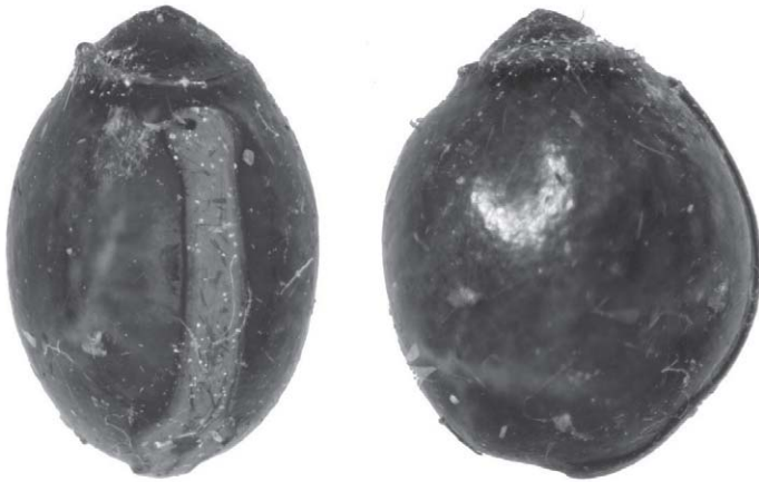
Fig. 2. The single, unbroken E. tiaratum egg collected from the manure of a chicken. (Photos by Andrew Richards).

or shell halves of the R. artemis eggs and three whole but crushed, R. nematodes eggs were recovered from the quail manure (Fig 3). All other eggs had been digested beyond recognition. In total, out of 935 eggs fed to the birds, 884 were eaten (94.5%), and of these, only one (0.11%) passed the gut whole enough to remain viable.