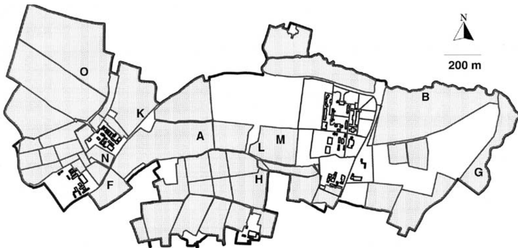
Fig. 1. Location of the study plots on the Writtle College Estate.

Sampling method for grasshopper populations. — In this study the method used for surveying grasshoppers was adapted from Ausden (1996) and Gardiner & Pye (2001). The size of the quadrats used in the survey was 4m 2 (2 X 2 m). Ten quadrats were positioned using random co-ordinates in a 100-m 2 plot at each study site. The corners of each quadrat were marked using poles, without disturbing the grasshoppers within by casting shadows. Two types of plot were used: a standard 10 X 10-m plot and a linear plot of 5 X 20 m for grasslands such as roadside verges, where it was impossible to accommodate the former plot. Each plot at the study sites was surveyed to ascertain grasshopper abundance once in July and once in August, in both 2000 and 2001. Surveys were conducted in these months as adult grasshoppers are most abundant in midsummer. Only adult grasshoppers were recorded in this study because during this life stage identification can be confirmed without the capture of individuals (Richards & Waloff 1954).