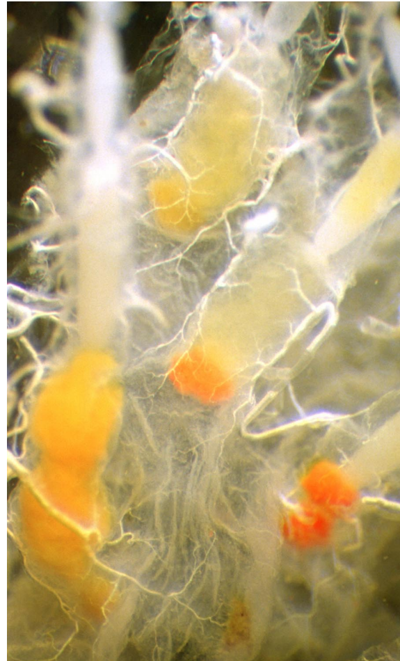
Fig. 4. Oocyte resorption bodies in ovarioles of a female that has just laid. Early orange and red oocyte resorption bodies (ORBs) in rows 1 and 2. Old yellow translucent follicle resorption body in row 1 and recent whitish FRBs.