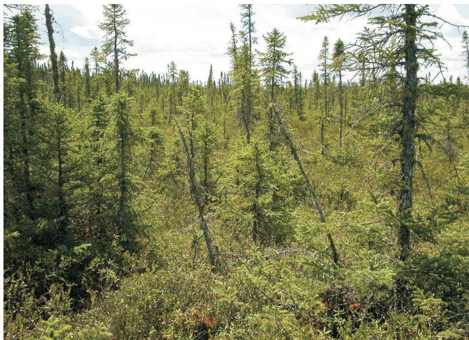
Fig. 4. A black spruce and sphagnum bog near Upsala in northern Ontario is the habitat of M. sphagnorum . See Plate V.