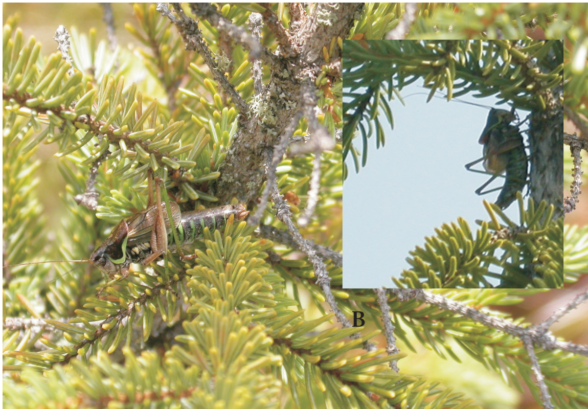
Fig. 3. M. sphagnum male. (A) walking within spruce branches and (B, Inset) shown silhouetted against the sky in a typical head-up, bent-abdomen, stridulation posture. See Plate V.

context of interactive behaviors, so there is little in the literature about 'voluntary' sound level changes. But there is probably much about intensity that is adaptive.