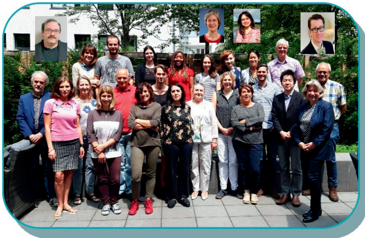
FIG. 2. The LDLensRad Consortium members in Munich, Germany in 2018.

brilliant skills of data analysis and interpretation. He co-authors three of the manuscripts in this special issue.