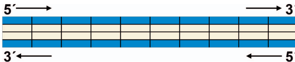
FIG. 3. Structural design of the detailed damage scoring in field 7 of the data structure.

The damages are stored as three comma-separated integers: the first integer lists the number of base damages; the second integer is the total number of single backbone breaks, including those contributing to the formation of a DSB; and the final number is a binary (0 or 1) indicating the presence of a DSB, i.e., if lesions occurred on both backbones within the BP range defined in the header. For example, “3, 2, 1;” would represent a damaged DNA site consisting of three (3) base damages with two (2) backbone damages that are on opposing strands within the BP limit and thus are counted as a DSB (1). Additional examples are listed in Fig. 4.