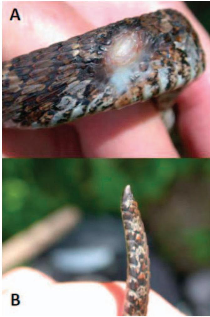
FIG. 1. Examples of injuries in Common Watersnakes ( Nerodia sipedon ). (A) Injury to body. (B) Loss of end of tail.

venomous snakes. True, some natricines are mildly venomous, and people sometimes react to their bites (Hayes and Hayes, 1985; Gomez et al., 1994), but I am not aware of any fatalities or long-term effects from such bites. In fact, Rhabdophis is the only natricine genus that has any dangerously venomous species (Greene, 1988, 1997), but when molested, these snakes generally resort to other antipredator measures before biting (Mori and Burghardt, 2001).