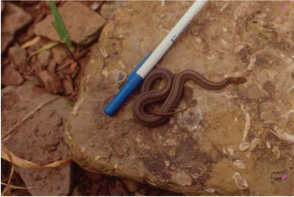
FIG. 3. An adult female Storeria occipitomaculata . Although individuals of this small species are sometimes found in the open, they are typically found hiding under cover such as rocks.

it. I am usually alerted to this if somebody else notices the snake or if the snake decides to move away soon after I've nearly stepped on it, but if the snake does not move, I easily might not see it at all and simply move on. In any case, the snake faces a dilemma—whether to move or to remain frozen in place. Either action could be the correct one, but either also could be an error. A decision has to be made especially quickly if the predator surprises the snake (and perhaps itself) by coming upon the snake suddenly and at close quarters, an experience I have had as a snake hunter many times.