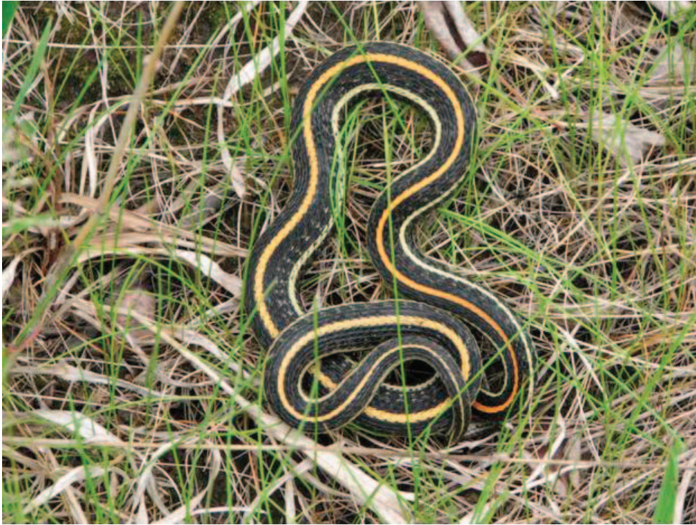
FIG. 5. Head-hiding behavior in a Thamnophis radix .

this behavior (Gregory, 2008a; Fig. 6). Among other natricines, at least four species of Thamnophis (Gregory and Gregory, 2006; Schield and Wayne, 2012; Enge, 2015), two species of Storeria (Jordan, 1970; Gerald, 2008), and one species of Regina (Oldham et al., 2015) may exhibit elements of death-feigning behavior when handled.