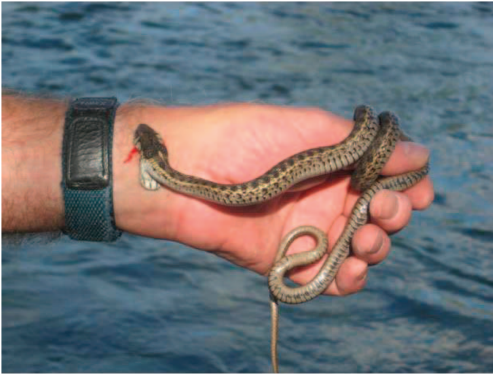
FIG. 7. A newly captured Thamnophis elegans vigorously bites the author's wrist.

anecdotal, but I do not think I have seen any gartersnake move with such urgency in response to my approach. Real life-and-death situations call for desperate effort, but can snakes somehow distinguish the differential threat posed by a mink and a benevolent human?