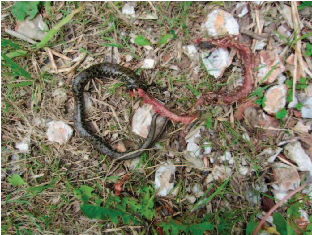
FIG. 2. A recently killed Natrix natrix found in the field.

Approach and attack may be combined as one single action but can also be separate, as in the case of a predator approaching a prey but failing to attack because of aggressive defense posturing by the prey (Arnold and Bennett, 1984; Greene, 1997) or because of “flash” or “startle” coloration that is exhibited when the prey’s body is flattened defensively (Shine et al., 2000; Westphal, 2007). This sequence can be simplified even further as a continuum from avoiding detection through avoiding capture to avoiding consumption.