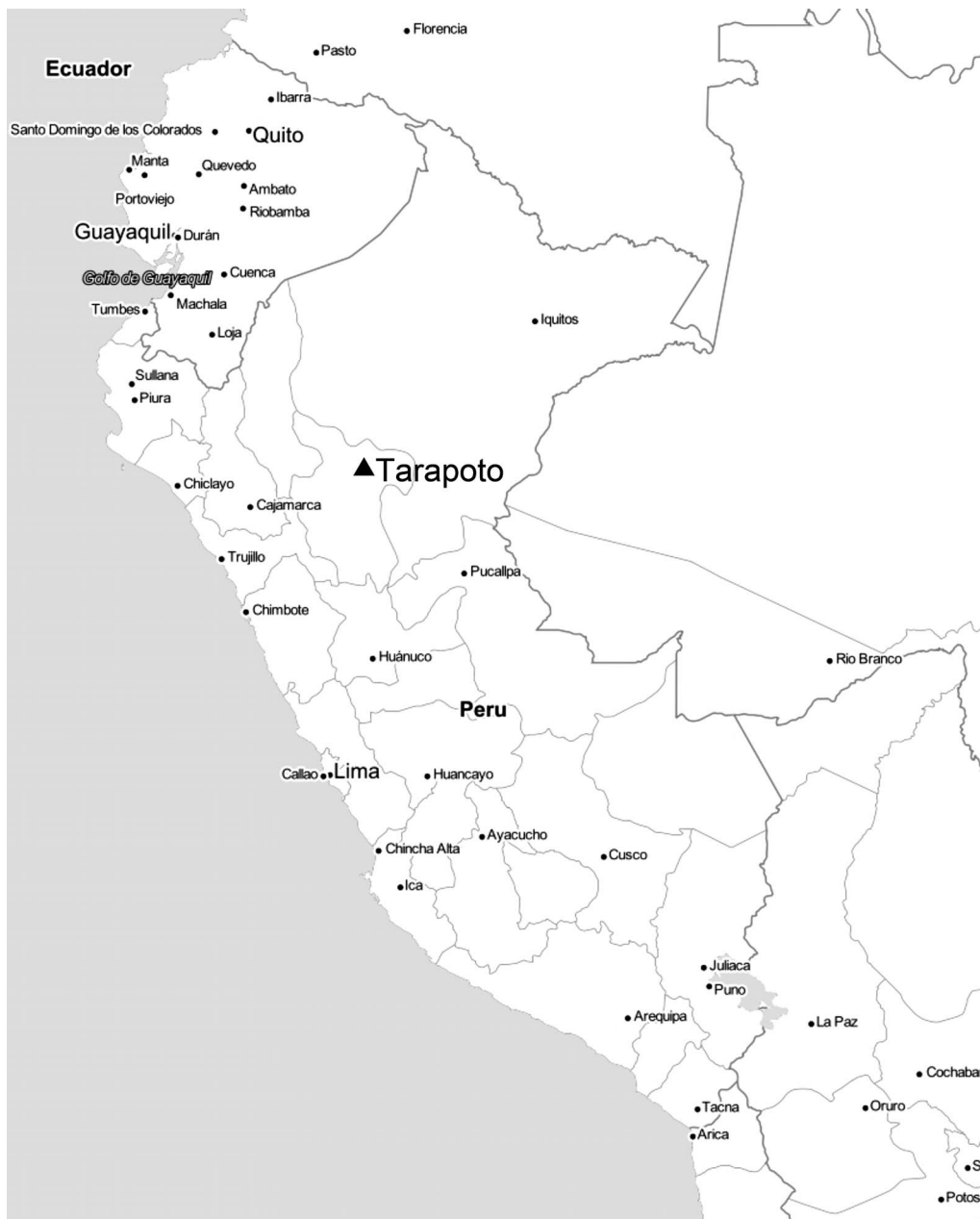
FIG. 1. Map of our study site near Tarapoto, in the Department of San Martín, in Peru. Tarapoto is indicated with a triangle.

visual model function provided in the 'pavo' package (Vorobyev et al., 1998) against the average reflectance of three Dieffenbachia leaves taken in the field. We chose to use Dieffenbachia reflectance because R. imitator frequently breeds in Dieffenbachia (Brown et al., 2008b) and all males were seen on these plants during this study. The visual model function is based on stimulation of different cone types, and assumes that color discrimination is in large part limited by receptor noise (Vorobyev et al., 1998). This calculation allows us to examine both chromatic (dS, color-based) and achromatic (dL, luminance or brightness) contrast to the background in units of just-noticeable differences (JNDs), a unit of differentiation in which JND = 1 indicates a difference that is at the threshold of discrimination for a viewer (derived from Vorobyev et al., 1998). We used the average avian visual system and ideal, white illumination in our visual model (data provided within 'pavo').