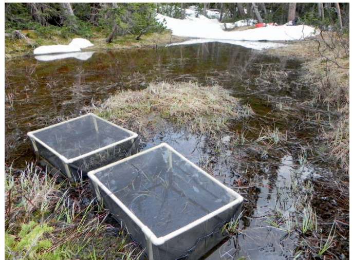
FIG. 2. Photograph of two caged Boreal Toad egg mass halves at Spruce Lake. The paired exposed egg mass halves are not visible, but located directly adjacent to each cage.

Embryo Survival: Data Collection. —We explored the potential effect of Cutthroat Trout presence on survival probabilities for