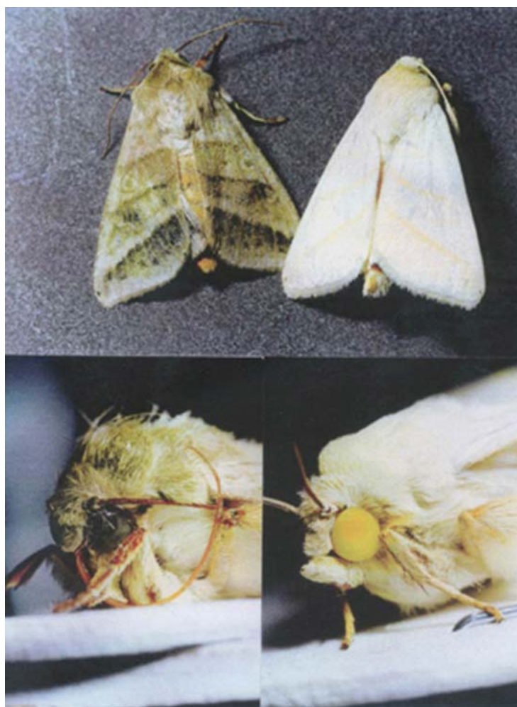
Figure 1. Mutants of scale color and eye color in Heliothis virescens ; Upper left: wild type scale color (green); Upper right: mutant scale color (yellow); Lower left: wild type eye color (grey); Lower right: mutant eye color (yellow).