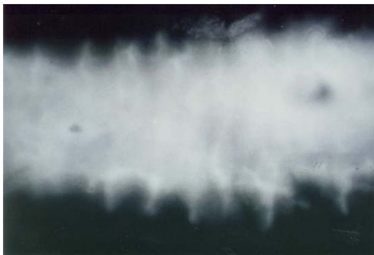
Figure. 1. Fluorescence intensity of midgut lumens of Chironomus luridus larva (untreated and without a tube), vital stained with fluorescein. The picture was taken while in peristaltic movement. Taken with fluorescent microscope at 100x.

fluorescent dye is shown in Fig. 1. The fluorescent dye fills the midgut lumen and does not penetrate other body compartments. Exposure of the larvae to copper causes cell injury that results in FLU penetration into larval organs. Following the exposure to copper, significant differences were found between high FLU penetration into larval organs in larvae without tubes, as opposed to low FLU penetration in larvae within silt tubes (Table 1). Significant differences were found in all the 5 examined body compartments and in all tested concentrations (Table 2). The average FLU intensity calculated for three tissue types (the larval body, gills, and Malpighian tubules) in the 50 mg/l treatment, as compared to tap water controls, was doubled in larvae in tubes, whereas it was elevated 36-fold in naked larvae (Fig. 2 c, d, e). When the copper concentration was elevated to 100 mg/l, permeability into all body compartments of the naked larvae decreased, while permeability into the various tissue types of larvae in silt tubes increased, as compared to the 50 mg/l treatment (Fig. 2).