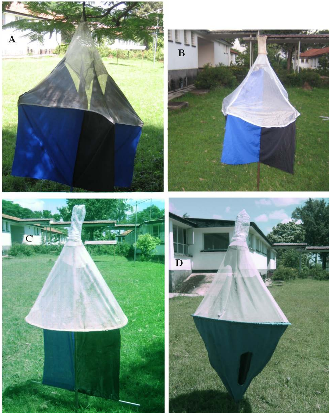
Figure 2. Photographs of the different trap designs that were tested. A) Pyramidal trap, B) Modified pyramidal trap, C) Monoscreen trap, D) Biconical trap.

with sustainability (Dransfield et al. 1991; Lancien 1991).