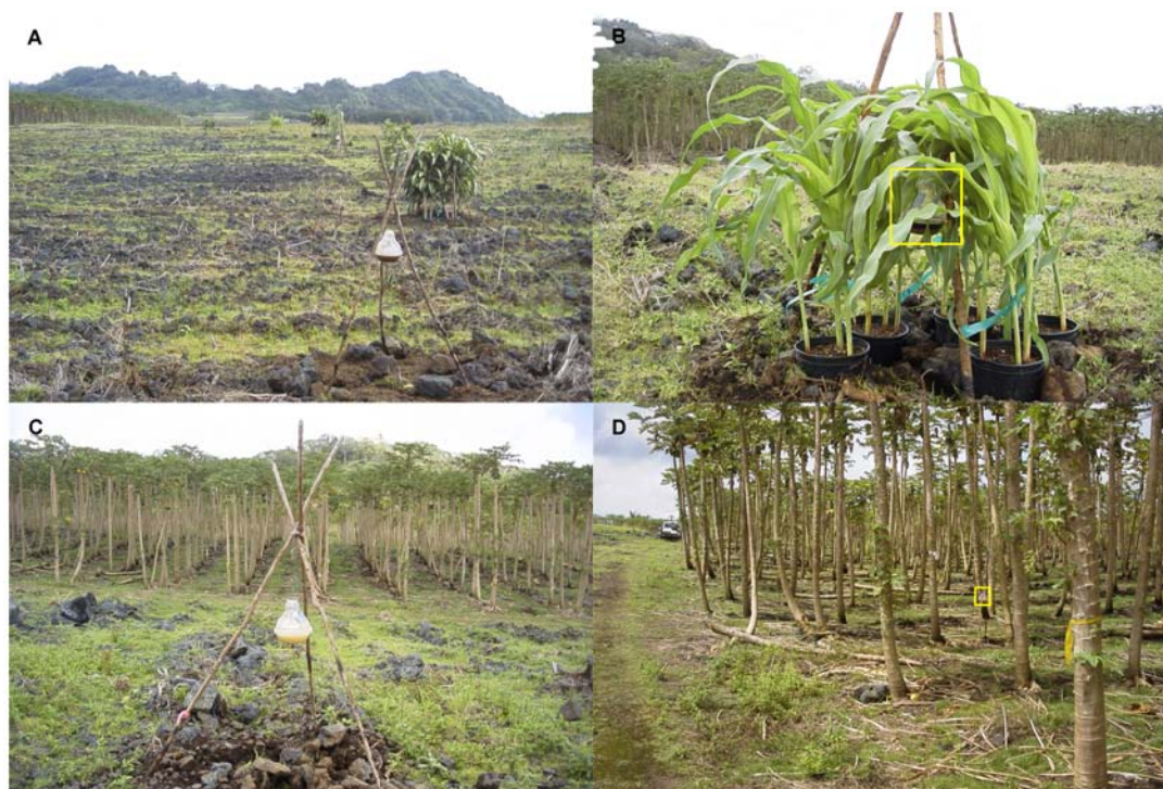
Figure 2. A. Overview of trial set-up with papaya orchard to the left and protein bait traps, placed both with and without (Control: “PB-Field”) association to clusters of pots of test plants arranged 20 m from the border of the papaya orchard; B. Close-up of plant cluster (here, corn) showing central positioning of protein bait trap (inside yellow square); C. Control (without association with potted plants) protein bait trap, in open field 20 m from the border of the papaya orchard; and D. Protein bait trap (inside yellow square; Control: “PB-Papaya”) hung from “tripod” positioned between papaya trees in from the border.

Tree Trial (conducted 15 Oct. – 4 Nov., 2002). Fruit tree species previously reported to be attractive to melon flies, or found to be sites of higher melon fly catch in cue-lure baited traps of the melon fly suppression program, were obtained from a local fruit tree nursery and maintained in pots. Additionally, the weed species in Trial C that was most attractive to both melon fly and oriental fruit fly (castor bean) and one of the most attractive border plant species from this trial (tiger’s claw) were also included in the Fruit Tree Trial to provide comparison with results from the earlier trials. Plant species included in the four trials are listed, by plant type, in Table 1. Tables 2 and 3 list the specific plant species used in each trial.