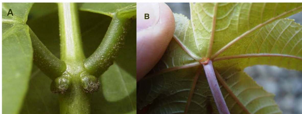
Figure 3. Extrafloral nectaries in A. Tiger's claw; and B. Castor Bean.

castor bean, Brazilian pepper tree, cocklebur, and ti plant, as well as a number of different fruit trees during nonflowering/nonfruiting stages.