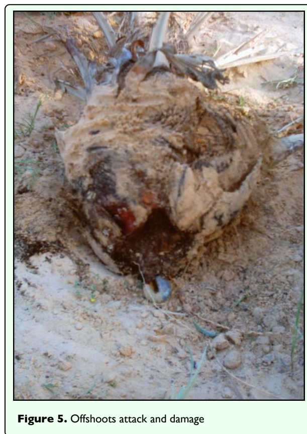
Figure 5. Offshoots attack and damage

Offshoots are used for oases extension and installation. In the Rjim Maatoug zone, the percentage of offshoot attack reached 100% in heavily infested palm plantations. Attacked offshoots showed a partial drying located on the side of the attacked part that can lead to a deceleration or arrest of development. At the end of this process, mortality of offshoots was caused by total drying, especially after separation from the mother plants. When planted, offshoots are autonomous and the drying process was accelerated. Rot installation due to high moisture generated by larvae presence can also occur (Figure 5).