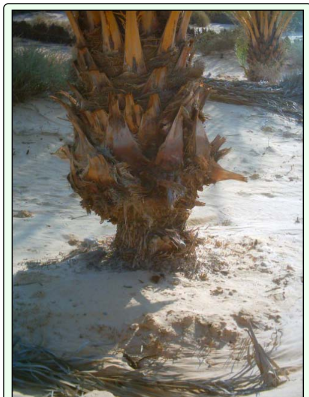
Figure 2. Aerial respiratory roots damage

of its collapse in response to the least amount of wind (Figure 2). Horizontal and epicentric destruction of the perimeter of the fibrous roots can reach the central zone represented by the conducting vessels.