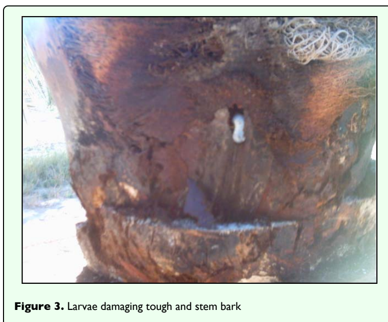
Figure 3. Larvae damaging tough and stem bark

Third instar larvae have robust mouth parts and initially attacked tough causing significant damage and creating varied geometrical forms of galleries in its layers (Figure 3). However, when groups are present in a limited space the amount of tough was insufficient to nourish these larvae during their long developmental period and consequently attacked stem bark, dry petiole and/or tough of the midrib of fronds. Larvae dug galleries on tough between the two neighbouring frond midribs. This phenomenon was frequent on the higher level of the stem situated under the crown.