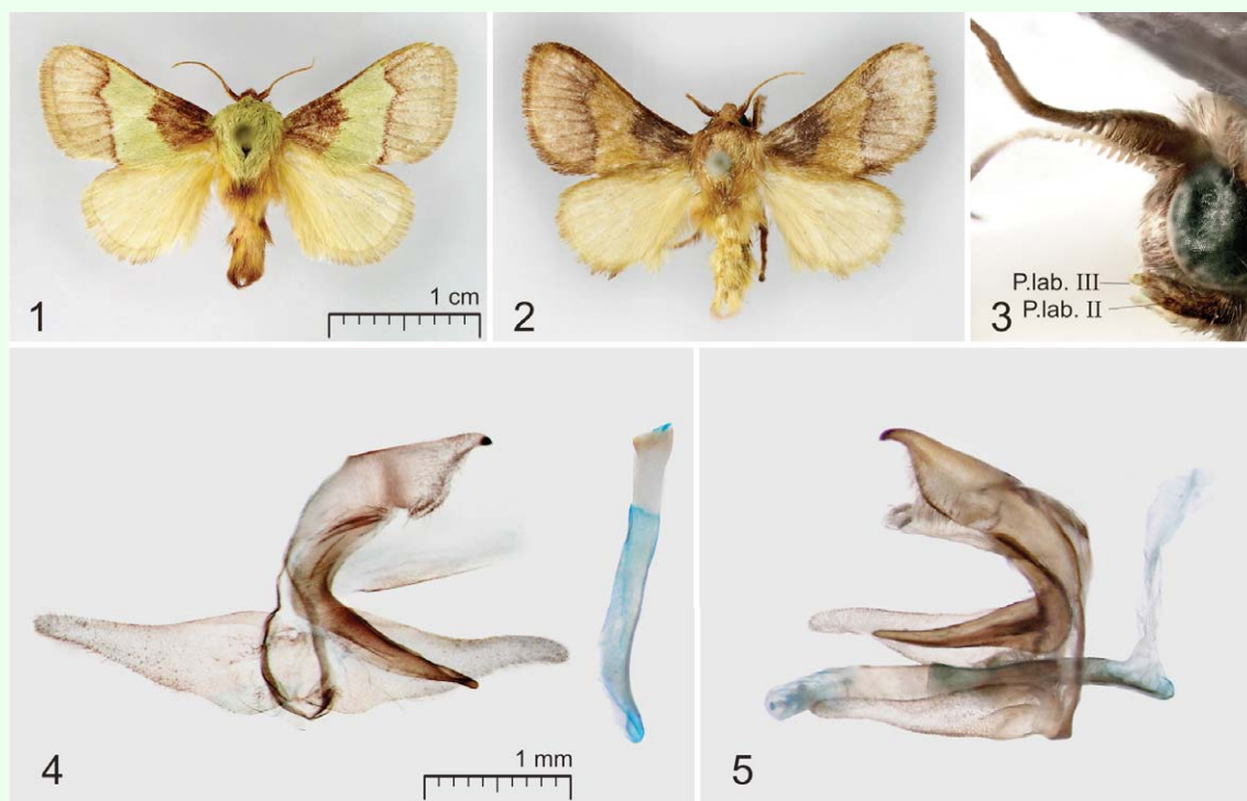
Plate I. Figures 1–5. Parasa dusii sp. n.; 1 – Male holotype; 2 – Male paratype (from Wadi Bura); 3 – head of the paratype (from Wadi Bura), lateral view; 4 – male genitalia of the holotype, aedeagus separated, back view; 5 – male genitalia of the paratype (from Wadi Bura), lateral view. Abbreviation: “P.lab. II” and “P.lab. III” means the second and third segments of labial palps correspondingly. High quality figures are available online.

1859 is described. Its exact systematic position is unclear because of a necessity of the revision of the African Parasa . The new species is untypical, with unusual tendency of substitution of the green pigment that is typical for other Parasa by reddish yellow.