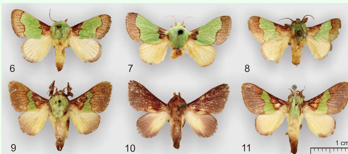
Plate 2. Figures 6–11. External view of the related species; 6 – Parasa ananii Karsch, 1896, holotype, ZMHB; 7 – P. thamia Rungs, 1951, holotype, MNHN; 8 – P. catori Bethune-Baker, 1911, holotype, BMNH; 9 – P. divisa West, 1940, holotype, BMNH; 10 – Delorhachis amator Hering, 1928, holotype, ZMHB; 11 – Stroter comatus Karsch, 1899, holotype, ZMHB. High quality figures are available online.