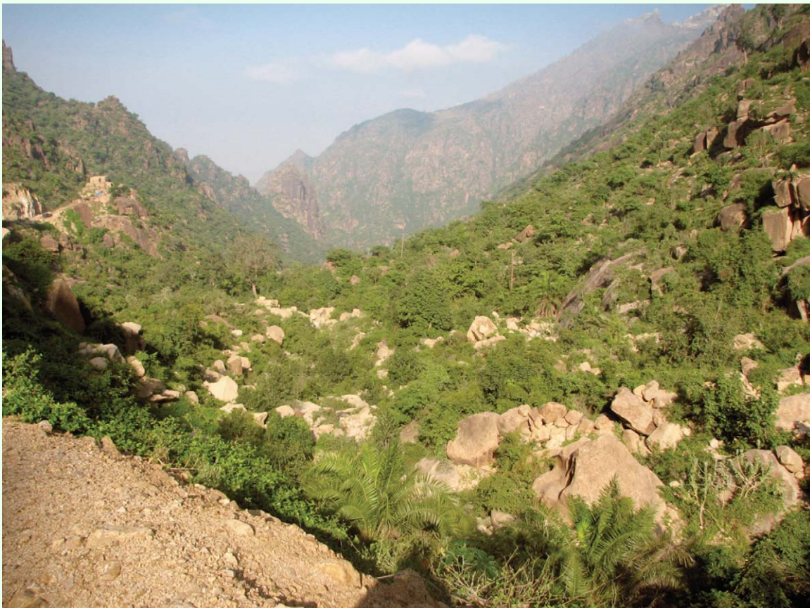
Figure 18. The biotope of Wadi Bura (Yemen), a locality of the paratypes (from Wadi Bura) of Parasa dusii sp. n. High quality figures are available online.

pattern consists of a basal brown area, pale brown distal area, and a medial area of any distinct color (green or different tints of yellow). The male genitalia are mostly diagnostic, with the uncus triangular in shape when viewed dorsally, lacking any spur; the gnathos is wide, strong and narrowed distally. The valvae are without saccular processes but with distinct sacculus and narrow weak cucullus. The juxta is unmodified, flattened. The aedeagus is tube-shaped, without any apical process. The vesica is without cornuti. The relationship of all mentioned species is probable, but no unique features have been found so far except this complex of diagnostic characters. As stated above, the species are regarded as members of different genera in spite of their close relationship. Their generic combinations are still provisional until a revision of the “Parasoid” complex is made and the diagnoses of all involved genera are improved.