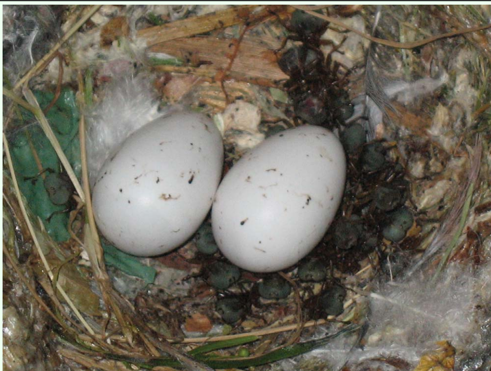
Figure 3. A nest particularly heavily parasitized by adult Crataerina pallida . There are approximately 20 adult C. pallida in this nest. High quality figures are available online.