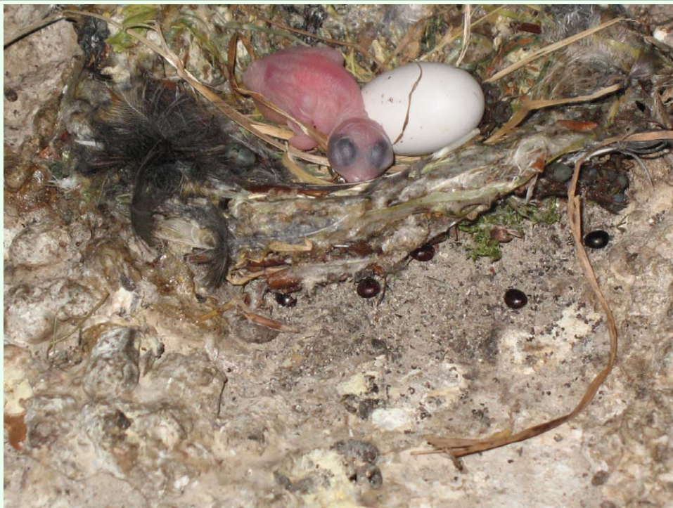
Figure 4. Pupae deposited to the side and beneath the nest. Two of the pupae are a dark brown in colouration, indicating that they have only recently been deposited. Pupae are typically black in colouration. Beneath the nest to the right is a small aggregation of adult Crataerina pallida that may be the result of mating competition. High quality figures are available online.

Other factors, such as the weather or climate, may also influence C. pallida numbers. A correlation between the abundances of a louse fly species on Serins, Serinus serinus , and the weather has been seen (Summers 1975). Recently fledged nestlings of the north island robin Petroica australis were more likely to be parasitized by C. pallida if they came from wetter territories (Berggren 2005).