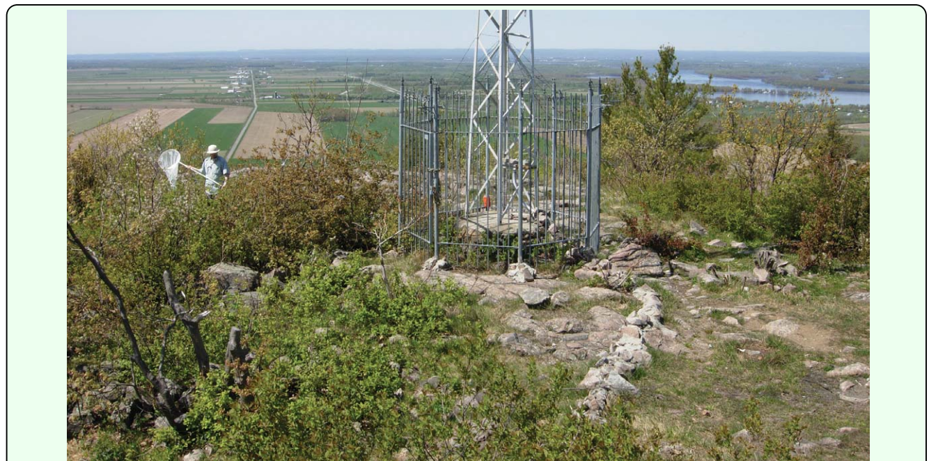
Figure 2. Summit of Mount Rigaud (Quebec, Canada 45° 27' 59" N, 74° 19' 35" W), looking toward the northwest. High quality figures are available online.

All data from Conopidae collected within 120 km of Ottawa, ON, Canada and represented in the Canadian National Collection of Insects, Arachnids and Nematodes are summarized. Ottawa was chosen as a focal point because three hilltops in the vicinity have received annual collecting attention since 1961. The hilltops involved are King Mountain, QC (49° 29' 20" N, 75° 51' 45" W), Duncan Lake vicinity, Masham, QC (45° 40' 53" N, 76° 3' 1" W) and Mount Rigaud, QC. The collections in the Museum of Zoology of the University of Rome “Sapienza” and in the Civic Museum of Zoology of Rome, were examined as well, to summarize data on any conopids collected within 1.5 km of the summit of Colle Vescovo.