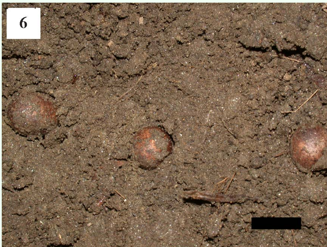
Figure 6. Reddish-brown spherical Scopelodes contracta cocoons in the soil. Scale bar: 10 mm. High quality figures are available online.

The presence of fallen leaves without basal parts and crawling larvae, together with the observations of individual larvae on leaves that were falling to the ground (Table 1) of four tree species and the high density of cocoons in the soil (Figure 6), indicate that mature S. contracta larvae parachute from tree crowns to the ground to spin their cocoons in the soil. Although the descent behavior has not been sufficiently observed for larvae, the larvae that were preyed on by ants under trees