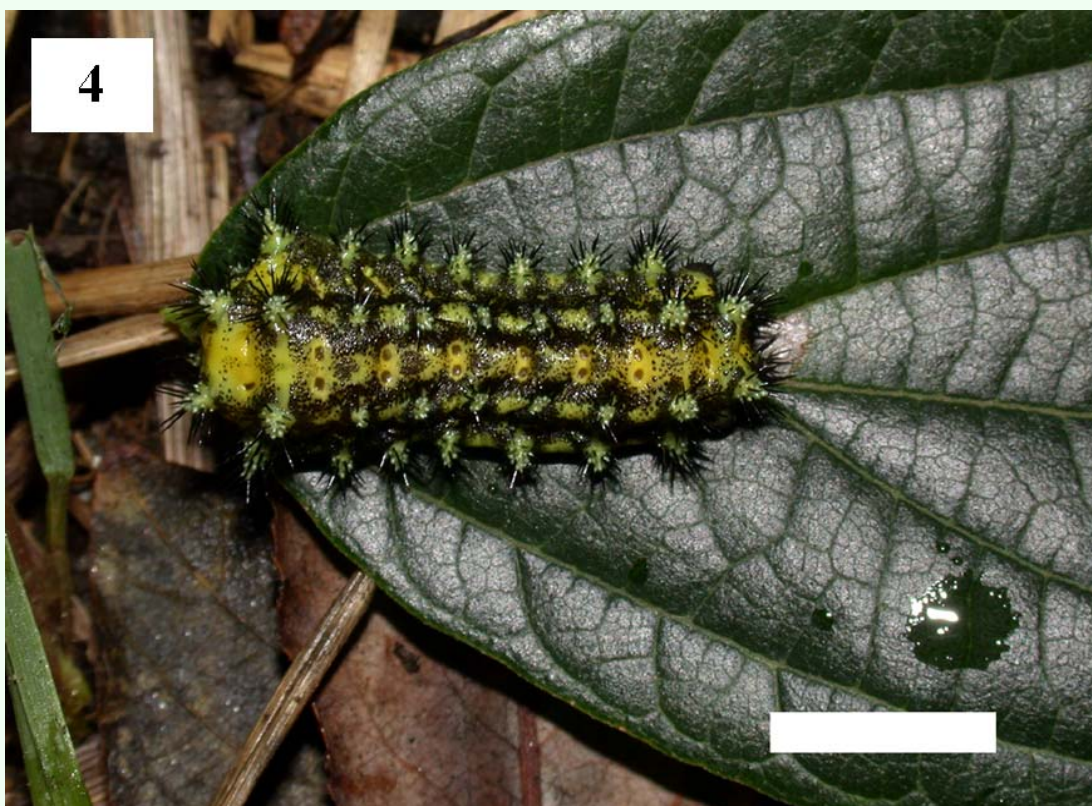
Figure 4. Scopelodes contracta larva on a Celtis sinensis leaf just after reaching the ground by parachuting. Scale bar: 10 mm. High quality figures are available online.