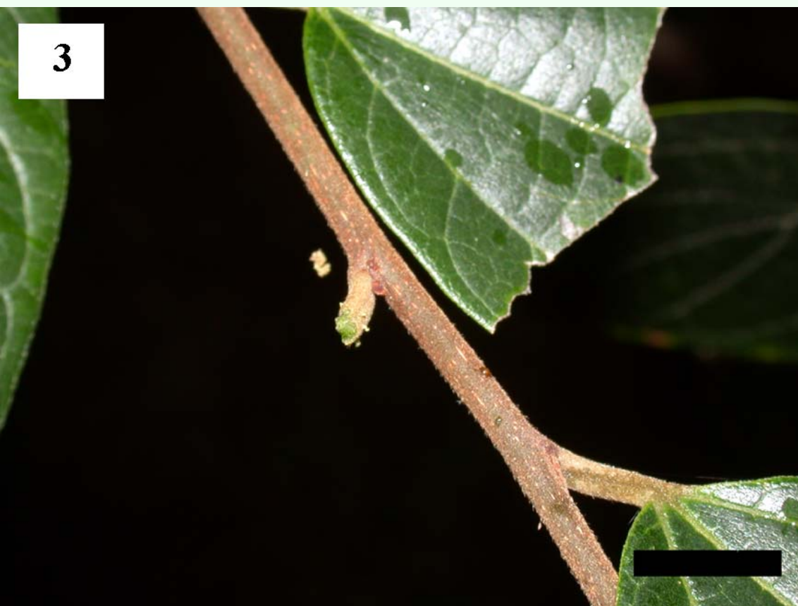
Figure 3. The petiole cut by the Scopelodes contracta larva. Scale bar: 10 mm. High quality figures are available online.