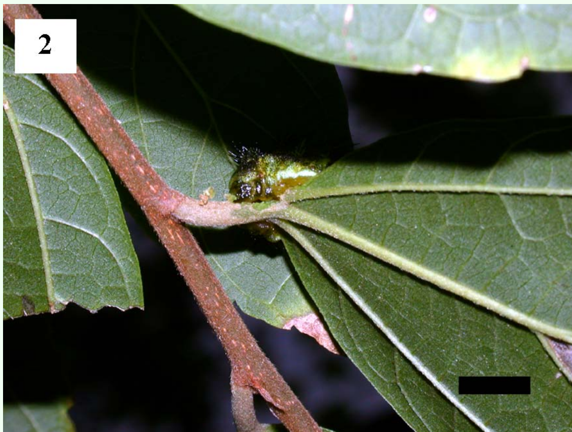
Figure 2. Scopelodes contracta larva feeding on the apical part of a petiole. The larva had just parachuted to the ground and was returned to a twig of the study tree. Scale bar: 10 mm. High quality figures are available online.