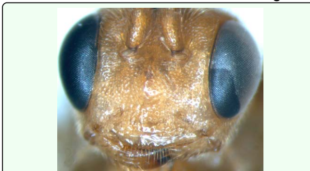
Figure 2. Laxiareola ochracea , Face. High quality figures are available online.

approximately 0.65 times as long as forewing. Scape almost cylindrical, approximately 2.3 times as long as its widest diameter; apical truncation nearly transverse; with 24 flagellomeres, ratio of length from flagellomere 1 to 5 in proper order: 4.0:3.8:3.6:3.4:3.2. Occipital carina complete, middorsal portion approximately horizontal.