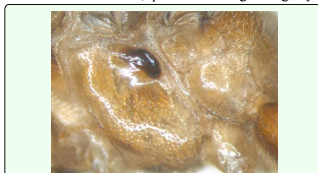
Figure 3. Laxiareola ochracea , Mesopleuron. High quality figures are available online.

raised, and touching mesopleural suture. Around mesopleural fovea smooth and lucent. Sternaulus very weak, about half as long as mesopleuron. Metapleuron smooth, upper-anterior portion with fine and indistinct punctures. Submetapleuron complete and strong. Wing gray-brownish hyaline. 1cu-a distad of 1-M, distance between them about 0.3 length of 1cu-a. Areolet absent. Vein 2rs-m basad of 2m-cu, distance between them about 0.7 length of 2rs-m. Vein 2-Cu 0.5 times as long as 2cu-a. Hind wing vein 1-cu strongly inclivous, about 4.6 times as long as cu-a. Apical edge of first trochanter of leg with a small tooth on the outer side. Apex of front tibia with a small tooth. Tarsal claws pectinate. Propodeum (Figure 4) completely areolate, dorsal profile (from base to posterior transverse carina) about 0.38 length of propodeum, posterior profile strongly sloping. Area basalis distinctly wider than long. Area superomedia approximately 1.8 times as wide as long, its lateral carinae weak. Area basalis and area superomedia with irregular wrinkles.