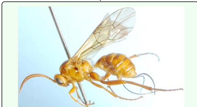
Figure 1. Laxiareola ochracea Sheng and Sun, gen.sp.nov. Body, lateral view. High quality figures are available online.