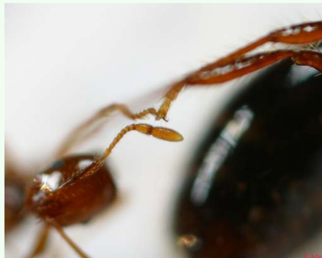
Figure 2. A tarsi-to-tarsi linkage between two Solenopsis invicta ants within the raft formation. These ants were separated from a frozen raft. High quality figures are available online.

Colonies capable of successfully creating the raft structure floated from 12 hours to 12 days in undisturbed laboratory trials (n = 11). The