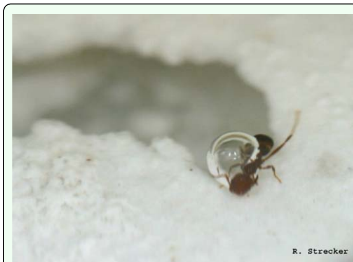
Figure 5. When trapped under the water, Solenopsis invicta workers were observed encroaching upon bubbles stuck on submerged substrate. The submerged ants usually contacted bubbles with the locations of their bodies associated with spiracles. High quality figures are available online.

praesaepium (Vinson 1997). Notably, setae on the head and within the praesaepium of larvae were neither recurved nor forked.