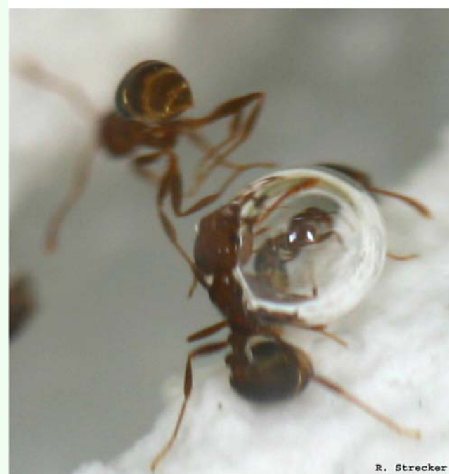
Figure 6. Submerged Solenopsis invicta workers use large bubbles to escape the water in the absence of brood. The workers in the second picture immediately rose to the surface on the large substrate bubble when it completely detached from the substrate. High quality figures are available online.

formation. The methods for the extraction of colonies of S. invicta from the soil, however, acted as a starting point (Jouvenaz 1977; Banks et al. 1981; Chen 2007). A new addition to the extraction techniques was the initial 1000 ml of water added to the arenas. This addition of water helped to separate any