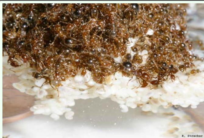
Figure 1. A raft of Solenopsis invicta formed by interconnected ants on top of a foundation of brood. High quality figures are available online.

Ants' use of bubbles was recorded through the observation of the behavior of individual ants caught under water during flooding. Photographs and notes were taken of any unusual behavior and the location of bubbles on submerged workers was recorded. Furthermore, the presence of bubbles on larvae was observed under a microscope by submerging individuals and groups of brood underwater in a large Petri dish (150 mm x 25 mm). Due to the extremely hydrophobic nature of brood, individual brood were glued (Loctite Super Glue, www.loctite.com ) on their dorsal side to the bottom of the Petri dish for photographs. Observations were made of both glued and unglued brood to ensure no external effects were caused by the glue. Photographs of submerged brood were taken using a Syncroscopy Automontage system ( www.syncroscopy.com ). Morphology of larvae of S. invicta were compared with those of other ant genera including non-flood adapted Crematogaster , Nylanderia , and Tetramorium and a flood-adapted ant in the genus Linepithema . Larvae of the aforementioned ant genera were also submerged and observed to determine if bubbles adhered to their cuticles.