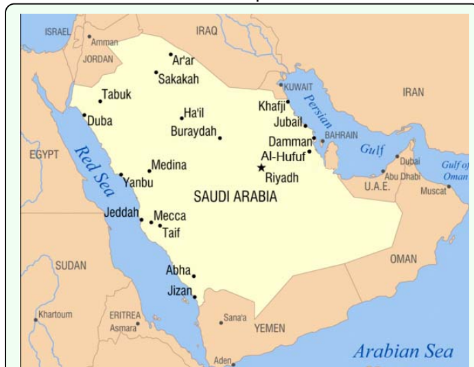
Figure 1. Map of Saudi Arabia showing Al-Hufuf, the capital of Al-Ahsaa district. High quality figures are available online.