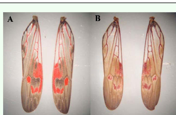
Figure 2. Comparison of wings from 1-day-old adult Homalodisca vitripennis (A) and 60-day-old adult H. vitripennis (B). High quality figures are available online

period of collection was between 26 May 2009 and 24 June 2009. This time period was used because this is when an "influx" of insects is known to occur consistently every year (Lauziere et al. 2008). The age of the insects were relevant because if they were young insects it would add weight to existing theories that F1 generation adults (F0 being the overwintering parents) have recently emerged and are actively searching suitable host plants. In two of the vineyards (labeled B and D), samples were collected approximately one month apart in order to compare the ages within the same vineyard. The wings of each H. vitripennis were removed and photographed as previously described.