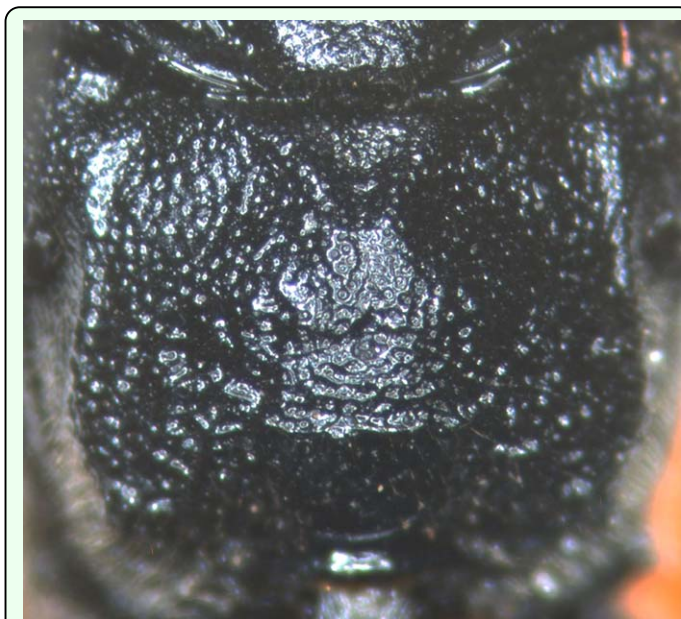
Figure 4. Lissonota holcocerica Sheng, sp.n. (4) propodeum. High quality figures are available online.

Metasoma. Metasoma robust, apical portion slightly compressed. First tergum about 1.2 times as long as apical width, with dense and distinct punctures, lateral portion rough, subapical with weak and short longitudinal wrinkles, basal-median portion concave and