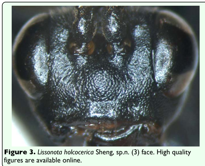
Figure 3. Lissonota holcocerica Sheng, sp.n. (3) face. High quality figures are available online.

and distinct punctures. Ovipositor sheath 2.5 to 3.0 times as long as hind tibia.