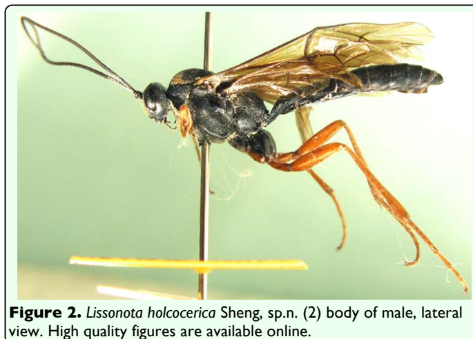
Figure 2. Lissonota holcocerica Sheng, sp.n. (2) body of male, lateral view. High quality figures are available online.