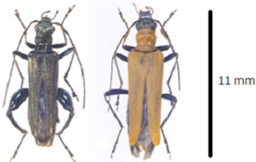
Figure 2. Male (Left) and female (right) of Oedemera podagrariae ventralis Meineitriēš. High quality figures are available online.