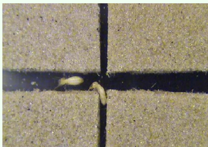
Figure 2. Behavior of a termite, turning its body vertically, while changing its moving direction at the intersection with the values of (2, 4) . High quality figures are available online.

tunnels ( (W_1, W_2) = (2, 3) , (2, 4) , and (3, 4) ), the values of \tau_L , \tau_R , and \tau_S were statistically the same in each case. For (W_1, W_2) = (2, 3) and (2, 4) , turning into wider tunnels at left or right may have saved time (hence \tau_L, \tau_R < \tau_S ), but termites also took more time to change their direction, and during the direction change at the intersection they turned their body vertically and walked on the sidewall (Figure 2). This behavior increased \tau_L and \tau_R , which consequently led to the result \tau_L = \tau_R = \tau_S . For (W_1, W_2) = (3, 4) , many termites turning left or right touched the right-angled corner of the intersection because of the deviation in their walking (Figure 3). As soon as the termites touched the corner, they exhibited the antennation behavior. This diluted the advantage of the relatively large tunnel width, which consequently led to the