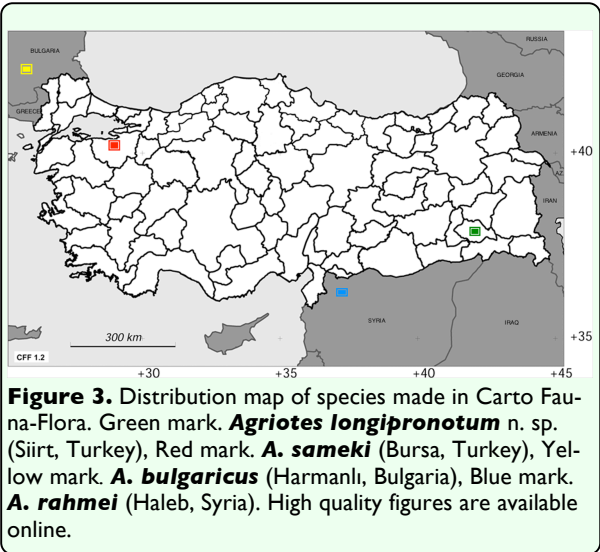
Figure 3. Distribution map of species made in Carto Fauna-Flora. Green mark. Agriotes longipronotum n. sp. (Siirt, Turkey), Red mark. A. sameki (Bursa, Turkey), Yellow mark. A. bulgaricus (Harmanli, Bulgaria), Blue mark. A. rahmei (Haleb, Syria). High quality figures are available online.

bulgaricus (Figure 2B), A. rahmei (Figure 2C), and A. sameki (Figure 2D) were redrawn from Platia (2003), Platia and Gudenzi (2007), and Platia and Nemeth (2011). The new species, A. borowieciorum Platia, Schimmel, and Tarnawski, A. constrictus Reitter, A. doboszi Platia, Schimmel, and Tarnawski, A. gul-