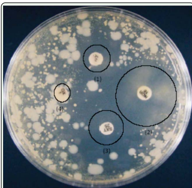
Figure 1. Comparison of inhibition zones produced by different antibiotics. The antibiotics shown are as follows: (1) Ampicillin, (2) Norfloxacin, (3) Cotrimoxazol, (4) Oxacillin. High quality figures are available online.

hatching) in the control was 5.44 days, but in treatments it was prolonged (5.85, 5.87, 6.1, 5.0, and 5.44 days at concentrations of 10, 20, 30, 40, and 50 \mu\text{g} antibiotic per mg diet, respectively). ANOVA showed that there were significant differences among treatments ( F=20.8 , df=5 , p < 0.0001 ), with the greatest delay in embryonic development at 30 \mu\text{g} antibiotic per mg diet (Table 2). Surprisingly, embryonic development at 50 \mu\text{g} antibiotic per mg diet was the same as in untreated con-