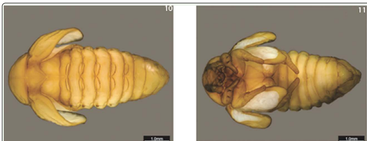
Figures 10–11. Pupae of Cyclocephala paraguayensis . 10- Habitus, dorsal view. 11- Habitus, ventral view. High quality figures are available online.

inent scleroma, left side more developed. Right side with 22 short setae. More than 30 straight, slender setae caudolaterad of the bases of the 2-jointed labial palpi. The bare median portion of the glossa is surrounded by 30 stout setae. Antennae. 4-segmented. Distal portion of segment 3 prolonged, with sensory spot. Segment 4 piriform, with 4 sensory spots (2 dorsal, 2 ventral), bearing few setae distally.