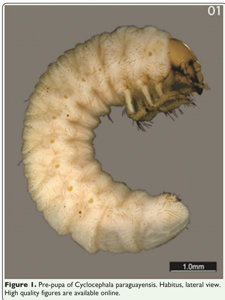
Figure 1. Pre-pupa of Cyclocephala paraguayensis . Habitus, lateral view. High quality figures are available online.

Despite numerous records of different species of Cyclocephala as crop pests (Cherry 1985; Pardo-Locarno et al. 2005; Blanco and Hernández 2006; Santos and Ávila 2007; Villegas et al 2008; García et al. 2009), our observations suggest that such is not the case for C. paraguayensis . The fact that captive-reared larvae thrived and developed into well-formed, fertile adults on an entirely saprophagous diet might indicate that they are not rhizophagous in the wild. However, Neita-Moreno and Morón (2008) have reported that the larvae of Ancognatha ustulata Burmeister (Dynastinae: Cyclocephalini) may adopt an herbivorous diet when deprived of suitable dead plant matter. Further investigation about the feeding behavior of immature Cyclocephalini should yield more solid results.