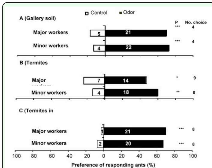
Figure 1. Preferences of Pachycondyla analis major and minor workers for odors from: A. Odontotermes sp. gallery soil; B. Odontotermes sp. workers and soldiers; and C. Odontotermes sp. and gallery soil when presented alongside clean air. Black bars represent response to odors, white bars represent response to the control. Numbers within bars refer to the number of ants making a choice, and numbers outside bars refer to ants that made no choice (N = 30 each for major and minor workers in each test, * = significant at P < 0.05 and *** = significant at P < 0.001 ). High quality figures are available online.