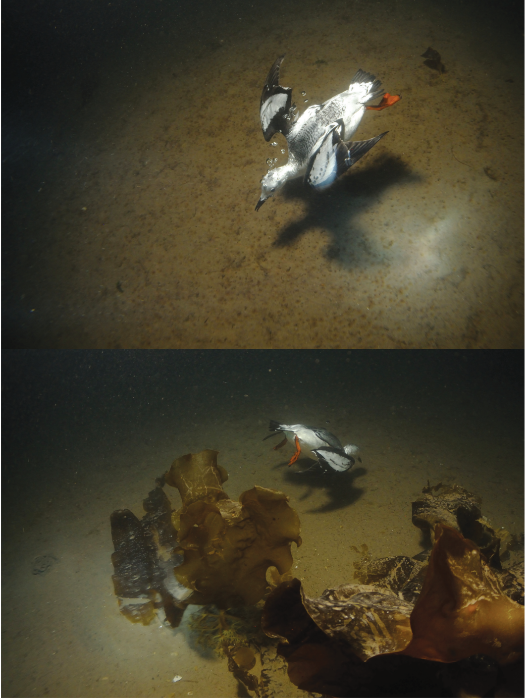
Figure 2. Actively feeding juvenile Black Guillemot in the beam of a diver's lamp in January 2015 in the Ny-Ålesund harbor on Spitsbergen Island, Svalbard Archipelago, Norway. The same individual is shown on both photographs.