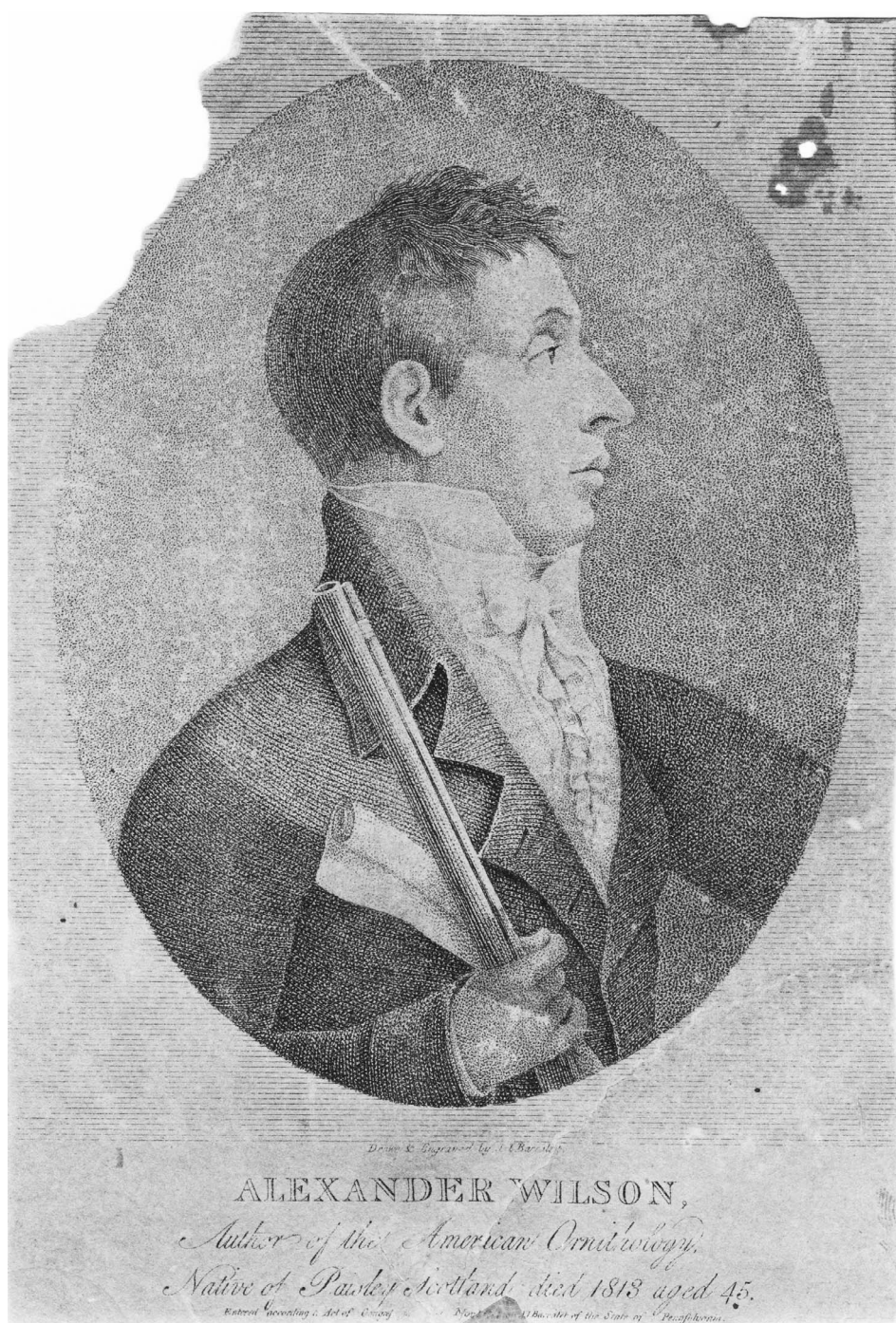
Figure 1. Portrait of “Alexander Wilson, author of the American Ornithology, Native of Paisley Scotland, died 1813 aged 45,” drawn and engraved by John James Barralet (1747–1815) within 2 years of the ornithologist’s death.