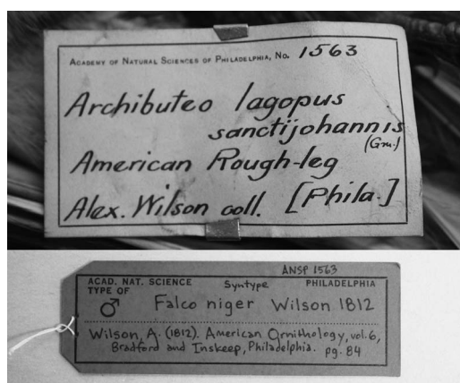
Figure 5. Two labels attached to ANSP 1563: (upper) a historical label created around the time the specimen was given its ANSP number; (lower) a modern type label written by the author in January 2019.

The bill of the bird in Wilson's Pl. 53 (1812) is open, but the bill of the specimen was later forced closed with a metal clamp, probably when it was dismantled in the late 19th century (see Fig. 3). A paper label attached to the specimen reads: "Academy of Natural Sciences of Philadelphia No. 1563 / Archibuteo lagopus sanctijohannis (Gm.) / American Rough-leg / Alex. Wilson coll. [Phila]." (Fig. 5). This information is corroborated by an entry in the ANSP specimen ledger: "Donor: Alex Wilson / Remarks: Wilson's orig. specimen" (ANSP Archives, coll. 54, box 1). However, this entry is easily overlooked because it is written in miniscule letters, with erratic penmanship, and a similar name ("Dr. Wilson," referring to ANSP trustee Dr. Thomas B. Wilson) appears 6 times on the same ledger page.