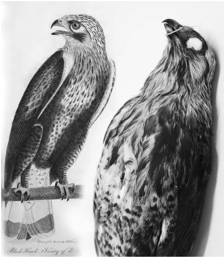
Figure 3. (left) Alexander Wilson's published image of the "Variety of [Black Hawk]" in American Ornithology (1812, Pl. 53). (right) Digital photograph of ANSP 1563, which served as the model for Wilson's drawing and was deposited by him in the Peale Museum in January 1812 (Peale Museum No. 405).

"no numbers ... on the specimens to fix their identity" (ANSP Archives, coll. 54, box. 4). Ten years later, by which time the modern ANSP numbering system had been implemented, Stone (1899) published a catalog of type specimens in the ANSP collection, in which he explained: "The collections [of the Peale Museum] were dispersed at auction upon the breaking up of the museum and such Wilson specimens as may have been there are probably lost. Two of the types [i.e., Broad-winged Hawk and Mississippi Kite] were, however, obtained in exchange by the Academy before the Peale collection was scattered" (Stone 1899:11). Stone (1915:512) later wrote that, along with the 2 specimens at ANSP and a third at Vassar College (see below), "[the MCZ specimens without data] probably comprise all that are extant