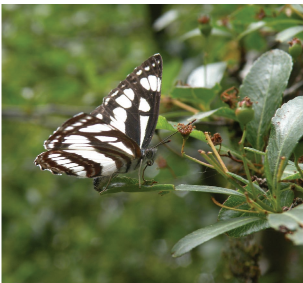
FIG. 2. A female Neptis mahendra ovipositing on Pyracantha crenulata .

Description: Forewing length: 18–29 mm. Expanse: 48 mm. Dry Season Form: Head, thorax and abdomen unmarked fuscous, iridescent under artificial light; antennae with tip of nudum brown. Recto surface of wings with ground colour black. Forewing cell streak clear white, discocellular bar faint, streak beyond cell wider than cell streak at discocellular bar; upper postdiscal band consists of 4 spots, the 2 costal spots reduced to small streaks; lower postdiscal band complete; postdiscal fascia obscure; submarginal series on an