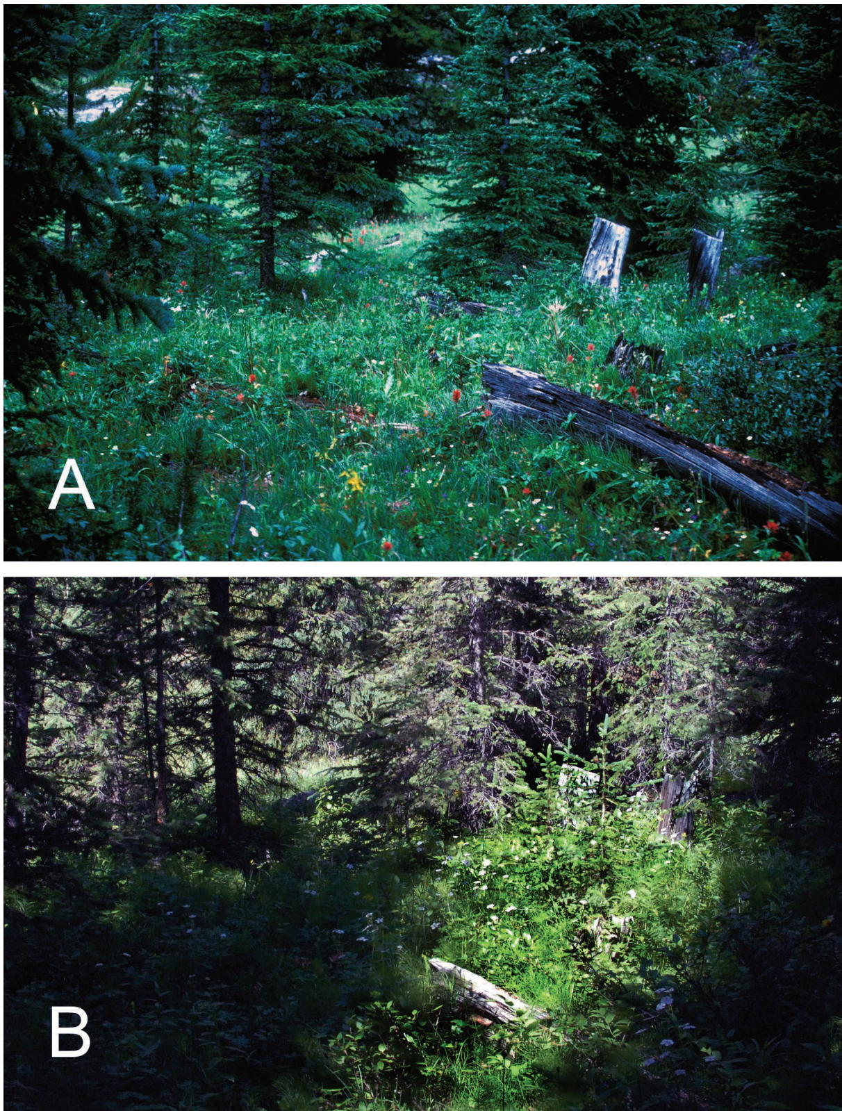
FIG. 3. Views of the same location from the same perspective in the middle of Beartooth site 1 from 29 July 1987 ( A ) and 31 July 2010 ( B ). Note the two stumps to the right. Over time, spruce, herbaceous vegetation, and willows have filled in what had been an open, flower-dominated site.