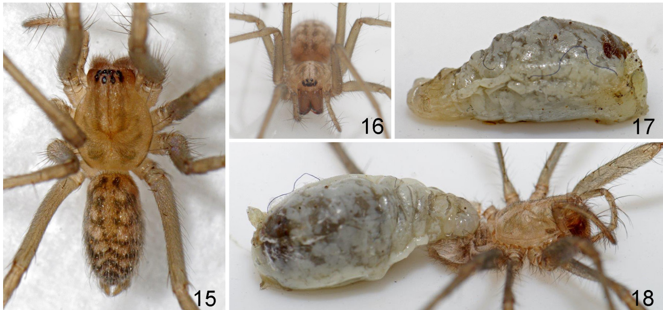
Figs. 15–18. Larva of Cyrtus sp. reared from female Eratigena sp. from Spain. The fly did not reach adulthood. 15. Eratigena sp. in dorsal view. 16. Eratigena sp. in frontal view. 17. Cyrtus sp. larva in lateral view. 18. Cyrtus sp. larva emerging from Eratigena sp. in lateral view.