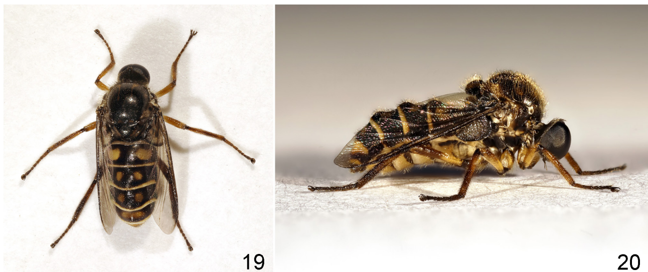
Figs. 19–20. Male Ogcodes guttatus Costa, 1854 reared from Pseudicius sp. from Rhodes (Greece). 19. Dorsal view. 20. Lateral view.

Note: at the time of collecting, the sluggish adult fly, which appeared to have eclosed from its pupa recently, was sitting on the spider remains.