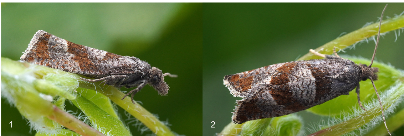
Figs. 1–2. Pelochrista pfisteri (Obraztsov, 1952), male from Germany, Tauberbischofsheim, Hunsenberg, 29.V.2023.

Males of P. pfisteri are about the same size as most congeners, with a wingspan of 15.5–16.5 mm. They can be easily distinguished from all other European species of the genus by the broader wings. The general colouration of the forewing upper side is somewhat darker than in most other European species. Fresh specimens have a clear reddish brown tint, the speculum (ocellar area near the tornus present in many species) is missing, and the dark median fascia (missing in most species) is, in contrast, well developed. This also distinguishes the species from other superficially similar European Tortricidae. In the male