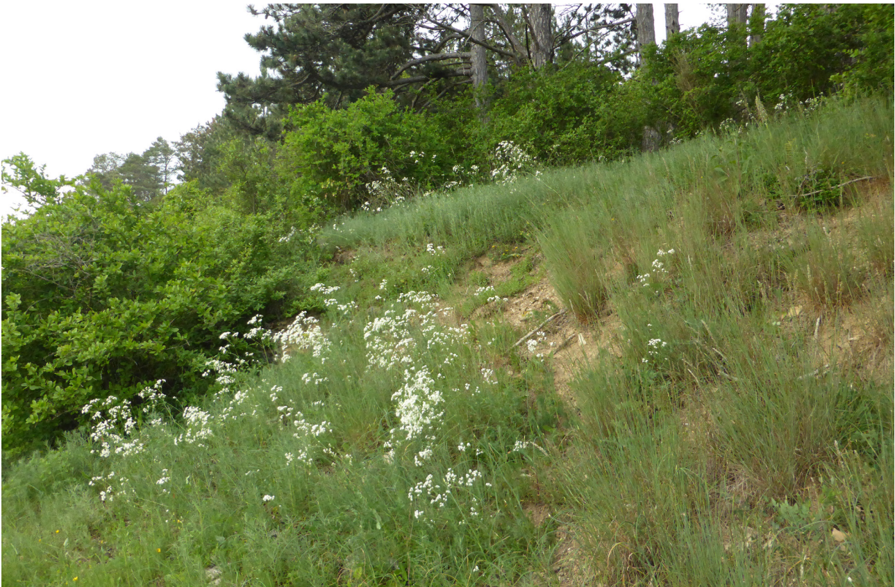
Fig. 8. Pelochrista pfisteri (Obraztsov, 1952), imaginal habitat (Germany, Tauberbischofsheim, Hunsenberg, 22.V.2023).

BIN: BOLD:AFL3048. A comparison of the COI fragment of P. pfisteri with data from the BOLD database suggests that its nearest neighbours (p-distance) are P. modicana at a genetic distance of 8.79% (BIN: BOLD:AAE7175), P. mollitana at a genetic distance of