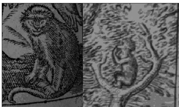
Figure 3. The monkey of the Tupinamba in Jean de Léry (1585)'s chronicle (left), and Theodore de Bry (1592, right).

This work included a review of the primates known in Europe by the first half of the XVIth century. In 1560, Gessner published his Icones animalium where the pre-Linnean zoologist published what seems to be the first scientific representation of a Neotropical monkey. The author showed different Old World monkeys such as a baboon and a macaque, primates from the Medieval imaginary, as well as the sagoin as an illustrated primate from the Americas (Fig. 1). A brief profile of this monkey, a marmoset ( Callithrix sp.), is also presented. He noticed morpho-behavioral characteristics such as its small size, and its agile and elusive nature. Gessner used the term Galeopithecum for referring to this primate.