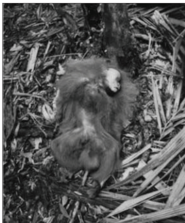
Figures 1 and 2. Male red uakari killed during a hunting party in the Cordillera Cahuapanas.

With this information, we organised field trips in 2009 and 2010 to collect scientific evidence for the presence of red uakaris in the mountains of northern San Martin.