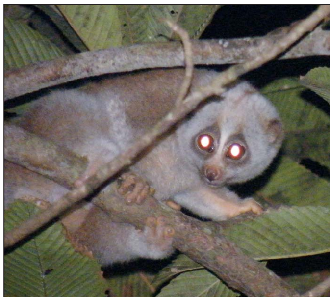
Figure 1. Bengal slow loris, Nycticebus bengalensis , in the state of Meghalaya, northeast India.

We obtained information on the presence of Bengal slow loris ( Nycticebus bengalensis ) through field surveys and secondary sources of information. Night transects were conducted along established human and animal trails, roads, streams, and rivers. In the case of paved roads passing through the forest, we used four-wheel-drive vehicles driven slowly (<5 km/hr), most especially in areas with high numbers of rogue elephant incidents. Once, we used a boat to survey forests along the river, as it provided the best access in that terrain.