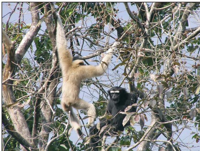
Figure 3. Adult female (left) and male (right) eastern hoolock gibbons ( Hoolock leuconedys ).

country), but only the hoolock gibbons can be seen and heard regularly. The other primates were very scarce. Biswas et al. (2007) also found stump-tailed and pigtailed macaques to be very rare in the Lohit and Changlang districts of Arunachal Pradesh. The low numbers of primates other than Hoolock gibbon in the Mehao sanctuary indicates regular hunting. Only the centuries-old traditional belief of the local “Idu Mishimi” tribe is protecting the hoolock gibbons there. Elsewhere in Northeast India, the gibbon populations are declining severely due to hunting (Das et al. 2005), habitat loss and habitat fragmentation (Chetry et al. 2007). Habitat loss and fragmentation resulting from encroachment, jhum cultivation (traditional slash and burn cultivation) and other horticultural and agricultural practices (especially ginger, cardamom, orange and tea cultivation) are major threats to the eastern hoolock gibbons and to other wildlife of the sanctuary.