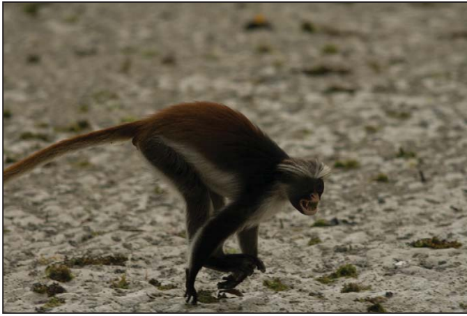
Figure 5. Adult male Zanzibar red colobus Procolobus kirkii running along a sandy beach, Vundwe Island, Zanzibar Archipelago, Tanzania.

Tana, Kenya, where P. rufomitratus lives at high densities of 165 individuals/km 2 (similar to the density of red colobus estimated in Uzi). The farm-field groups in Siex's study (Siex 2003), at a population density more than double of those in the Jozani groundwater forest (550 monkeys/km 2 compared with 235 monkey/km 2 ), were highly unstable and living at high densities because of habitat compression rather than intrinsic growth.