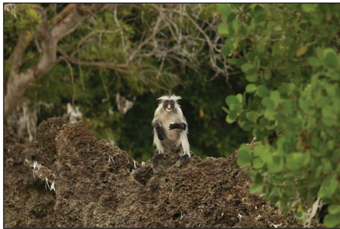
Figure 3. Adult male Zanzibar red colobus Procolobus kirkii eating mangrove flowers on coral rag, southern Uzi Island, Zanzibar Archipelago, Tanzania.

tended to be associated with lower numbers of monkey sightings, with an exception in Uzi, where Sykes's monkey and human encounter rates tended to correlate, suggesting their use of relatively disturbed forest at this site (Table 2).