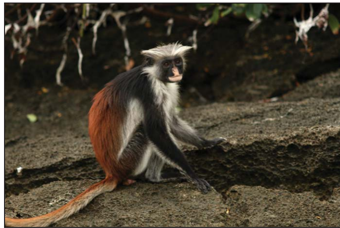
Figure 4. Adult male Zanzibar red colobus Procolobus kirkii sits on jagged coral rock formation, Vundwe Island, Zanzibar.

The results of these surveys, while conducted almost a decade ago, are suggestive of the relative value of degraded habitats to colobus and Sykes's monkeys. This value may