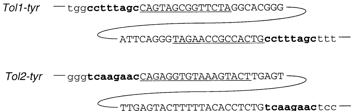
Fig. 1. Nucleotide sequences of Tol1 and Tol2 terminal regions. Tol1-tyr and Tol2-tyr are specific copies of Tol1 and Tol2 , respectively, inserted in the tyrosinase gene. Nucleotide sequences of their terminal regions are shown in uppercase letters. Tol1 has terminal inverted repeats of 14 bp each and Tol2 carries terminal inverted repeats of 17 bp and 19 bp, indicated by underlining. The sequences of the tyrosinase gene are shown in lowercase letters. Both elements are flanked by 8-bp target site duplications indicated by boldface letters.

More direct evidence for its transposition activity has recently been obtained. We exposed embryos of the albino strain to UV, and conducted PCR with a pair of primers encompassing the Tol1 insertion point. The length of a major PCR product was longer by 1.9 kb than the product with a wild-type fish. However, in some cases, minor products of a length identical, on agarose gels, to the wild-type form were observed. Cloning and sequencing of these products revealed excision footprints, remnants of Tol1 terminal regions or loss of nucleotides originally belonging to the