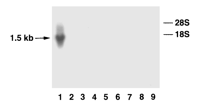
Fig. 3. Northern blot analysis of RNA from various organs of Bufo japonicus for detection of mRNA for tGCase. Total RNAs of the stomach (lane 1), brain (lane 2), kidney (lane 3), large intestine (lane 4), liver (lane 5), lung (lane 6), olfactory epithelium (lane 7), pancreas (lane 8) and small intestine (lane 9) were hybridized with the radiolabeled tGCase cDNA. The amount of the applied RNA was 15 \mu g in each case except for the stomach, where 5 \mu g RNA was applied.

Comparison of the amino acid sequence between the putative toad gastric chitinase (tGCase) and known vertebrate chitinase family proteins revealed homologies of 75.9, 70.3, 52.1 and 50.2% with mouse AMCase, bovine CBPb04, toad pancreatic chitinase and human chitotriosidase, respectively. Like these vertebrate chitinases, this putative tGCase was predicted to contain an N-terminal catalytic domain and a C-terminal chitin-binding domain (Fig. 2).