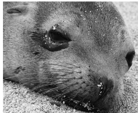
Fig. 1. A close-up picture of a sea lion ( Zalophus wollebaeki ) reveals a dense matrix of vibrissae. These tactile end-organs function to detect particles and vortices in the underwater environment.

Qualitative differences between the whiskers of sea lions and seals may explain variations in the animals' performance. Miersch et al. (2011) isolated single whiskers of both animals and tested the whiskers' response to underwater wakes. For both types of whiskers the researchers cal-