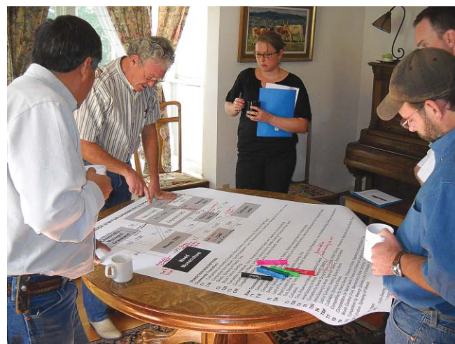
Figure 1. A group evaluating a state-and-transition model at a workshop.

Focus groups are small groups of 6–15 people who are invited to have an informal, semistructured conversation about a subject of interest. It is best to hold separate focus groups for different types of participants with similar backgrounds (e.g., ranchers, conservationists) so that the participants feel free to share information and opinions. Focus groups are an efficient way to gather a lot of information from a relatively large number of people in a short amount of time. Similar to an interview, the focus group discussion is guided by a list of open-ended questions. The group setting allows people to answer each question from their personal perspective, but also respond to and interact with the other participants. As in a workshop, the interactive aspect of focus groups can lead to insights that would not emerge otherwise. Focus groups could be used to develop a draft model, brainstorm an inventory of states, transitions, time scales, and indicators, or provide feedback on an existing model (Fig. 1). They are one of the most rapid of elicitation techniques, but take longer to prepare for than asking for feedback or interviewing individuals. A focus group requires a facilitator and another person to take notes. As with an interview, we strongly recommend audio-recording the focus group for accurate and complete documentation.