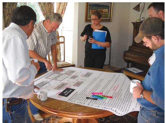
Figure 1. A group evaluating a state-and-transition model at a workshop.

Focus groups are small groups of 6–15 people who are invited to have an informal, semistructured conversation about a subject of interest. It is best to hold separate focus groups for different types of participants with similar backgrounds (e.g., ranchers, conservationists) so that the participants feel free to share information and opinions. Focus groups are an efficient way to gather a lot of information from a relatively large number of people in a short amount of time. Similar to an interview, the focus group discussion is guided by a list of open-ended questions. The group setting allows people to answer each question from their personal perspective, but also respond to and interact with the other participants. As in a workshop, the interactive aspect of focus groups can lead to insights that would not emerge otherwise. Focus groups could be used to develop a draft model, brainstorm an inventory of states, transitions, time scales, and indicators, or provide feedback on an existing model (Fig. 1). They are one of the most rapid of elicitation techniques, but take longer to prepare for than asking for feedback or interviewing individuals. A focus group requires a facilitator and another person to take notes. As with an interview, we strongly recommend audio-recording the focus group for accurate and complete documentation.