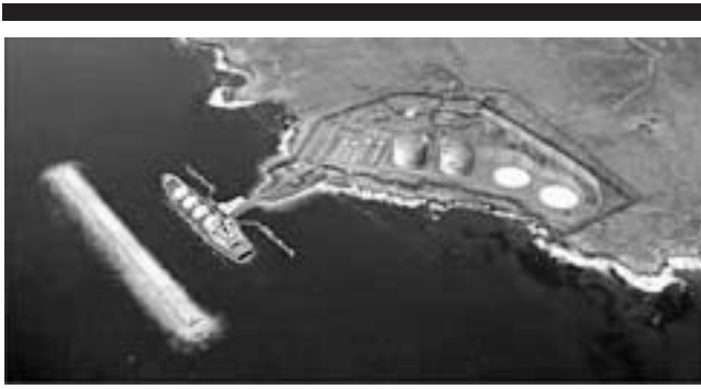
Figure 3. An aerial photograph of the newly constructed LPG terminal at Costa Azul, Baja, Mexico, which was constructed on top of world class surfing resource.

were 8 inclusions compared to 10 exclusions of surfrider groups. Of the surfrider groups that were included in the planning stage, only three saw their recommendations incorporated or partially incorporated into the design of the coastal protection.