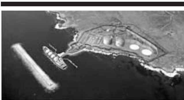
Figure 3. An aerial photograph of the newly constructed LPG terminal at Costa Azul, Baja, Mexico, which was constructed on top of world class surfing resource.

were 8 inclusions compared to 10 exclusions of surfrider groups. Of the surfrider groups that were included in the planning stage, only three saw their recommendations incorporated or partially incorporated into the design of the coastal protection.